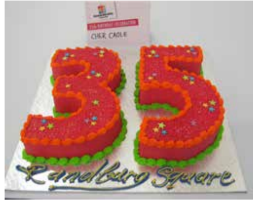
35th Birthday Cake-Off - Professional winner