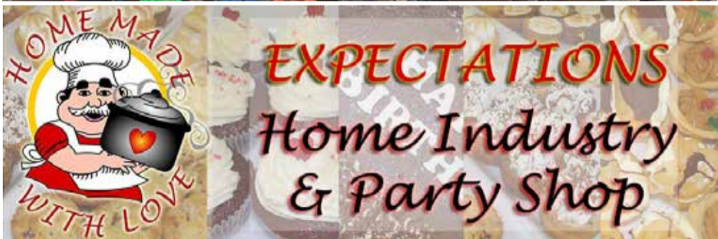
Moved in during the centre's 35th birthday celebrations end November 2013

A service which will put more money back into your pocket is using our Shoprite.mobi application for iOS and Android. Specials are updated regularly. All you need to do is access the Shoprite. mobi application, and present the discount codes at the checkout to qualify for even more discounts.