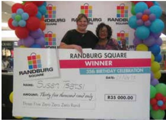
Shop & Win competition: winner R35000 mall vouchers