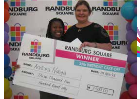
35th Birthday Cake-Off - Amateur winner