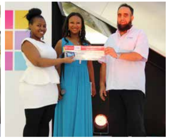
Vodacom Chatz Connect Alcatel Tablet winner