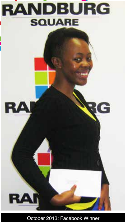
October 2013: Facebook Winner