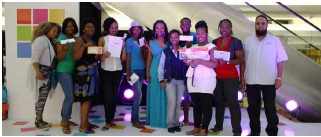
11 October 2013 Lifestyle Fashion show winners