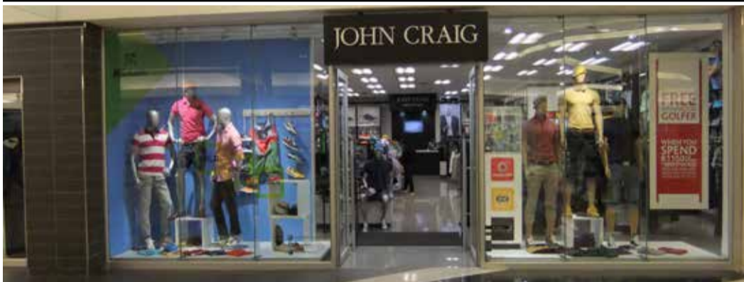
John Craig & Webbers joined the Randburg Square tenant mix end September 2013

Matrix Warehouse stock a large range of printer cartridges for Canon, H, Lexmark and Xerox. They are well known for their fast friendly service, and offer original cartridges at the best prices in town. Simply stop at the store to check out the savings you can get.