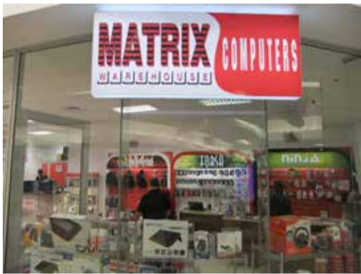
Matrix Warehouse opened their doors start of spring in September 2013